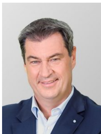
Dr. Markus Söder, MdL