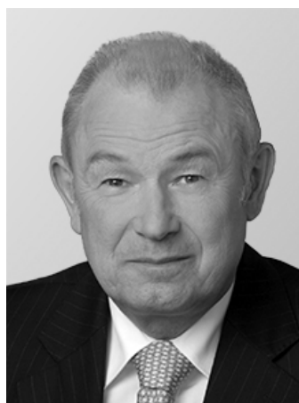
Dr. Günther Beckstein