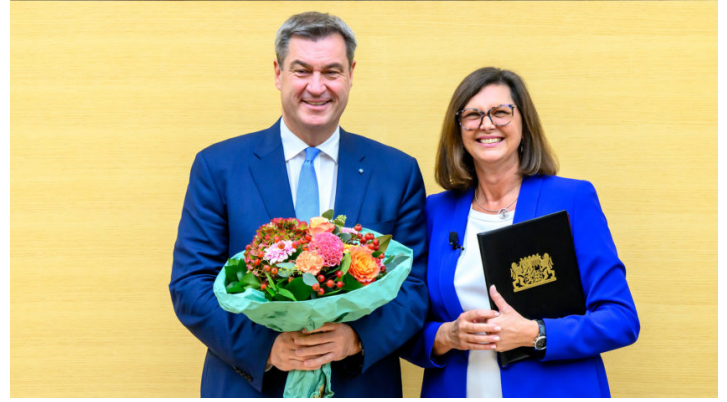
Minister-President Dr Markus Söder (left) and State Parliament President Ilse Aigner (right) after being sworn in as Bavarian Minister President on 31 October 2023.