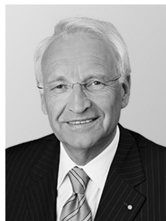
Dr. Edmund Stoiber