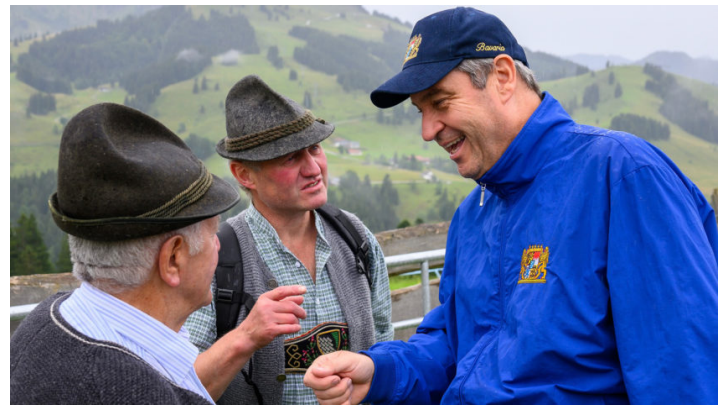
Minister-President Dr Markus Söder in conversation with alpine farmers at the 76th main alpine pasture inspection on August 2, 2023.