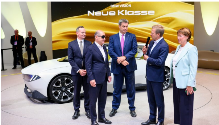
Together with German Chancellor Olaf Scholz, Minister-President Dr Markus Söder opened the IAA Mobility 2023 in Munich on September 5.