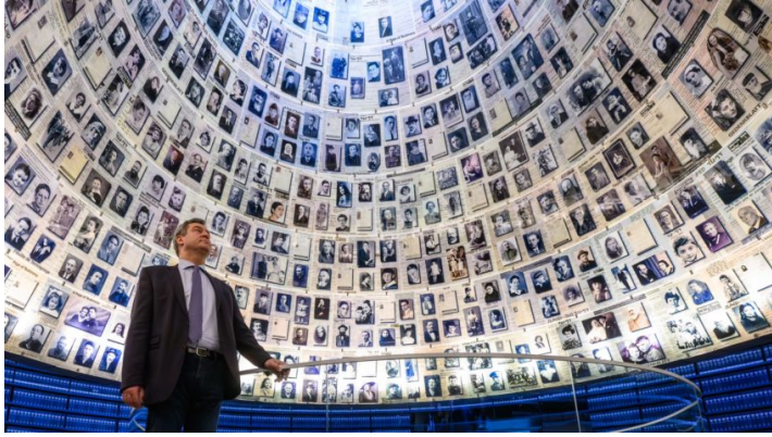
On 14 December 2024, Minister-President Dr Markus Söder visited the Yad Vashem Holocaust memorial.