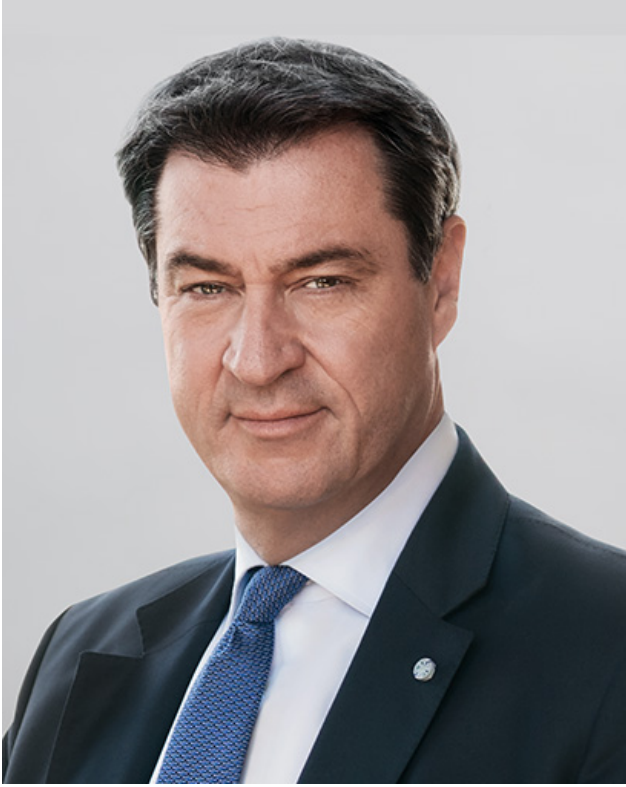
Portrait: Dr. Markus Söder, MdL

Born on 5 January 1967 in Nuremberg, married, four children