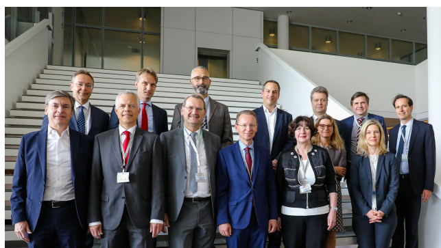
Group of heads of Human Resources at Infineon Technologies AG.

The Introductions Programme Building Bridges is aimed at heads of human resources departments. At informal meetings, top civil servants can exchange ideas with human resource managers from non-governmental organisations and leading corporations. At the same time, these meetings also provide an opportunity for casual discussions with colleagues from other governmental areas. The agenda comprises current topics that include employee mobility, diversity and inclusion, Social Media, recruiting young talent, Human Resource developments and health management. The aim of the programme is to make new contacts and strengthen existing ones — or in other words — to Build Bridges .