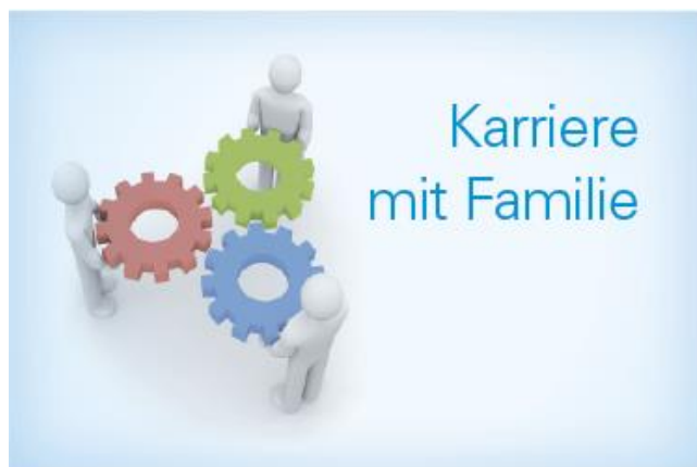
Logo Mentoring Programme

The Familienpakt Bayern (Bavarian Family Agreement), from the Bavarian State Government signals the improvements to come in balancing work and family life. Its aim is to adapt the world of work to changing life and family models. The ‘Career and Family’ mentoring programme is designed to help participants build the goals from Familienpakt into their own professional lives. This should be in keeping with the modern age, tangible and effective.